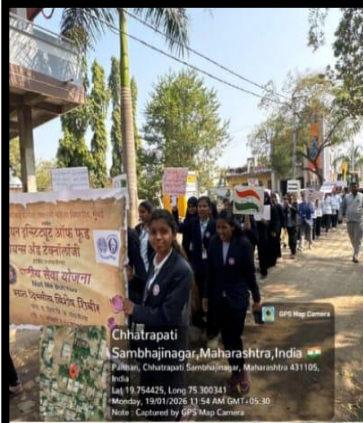
Chhatrapati Sambhajnagar, Maharashtra, India Pillay, Chhatrapati Sambhajnagar, Maharashtra 431105, India Lat 19.754425, Long 75.300341 Monday, 19/01/2025 11:54 AM GMT +05:30 Info