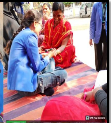
GPS Map Camera