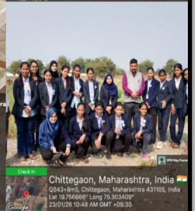
Chittegaon, Maharashtra, India Q843+8m5, Chittegaon, Maharashtra 431105, India Lat 19.756666° Long 75.303409° 23/01/26 10:48 AM GMT +05:30 Google