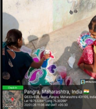
Pangra, Maharashtra, India Q833+928, Road, Pangra, Maharashtra 431105, India Lat 19.753284° Long 75.30266° 20/01/26 11:06 AM GMT +05:30 Google