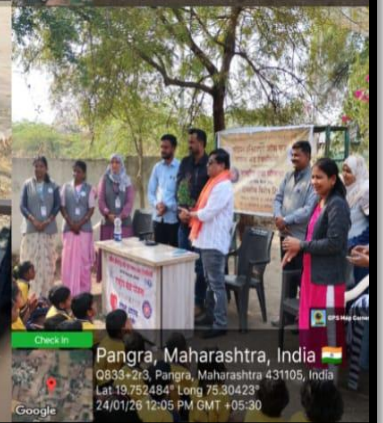
Pangra, Maharashtra, India Q833+2r3, Pangra, Maharashtra 431105, India Lat 19.752484° Long 75.30423° 24/01/26 12:05 PM GMT +05:30 Google