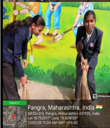
Pangra, Maharashtra, India Q833+2r3, Pangra, Maharashtra 431105, India Lat 19.752517° Long 75.304129° 23/01/26 11:24 AM GMT +05:30 Google