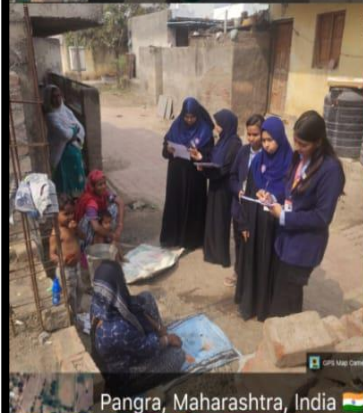
Pangra, Maharashtra, India